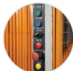
Pendant with emergency switch on all the floors