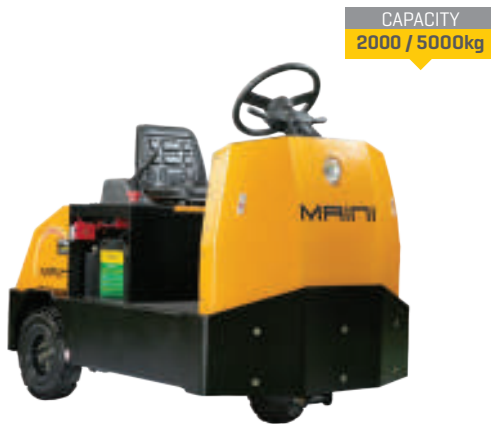
TT20 / TT50