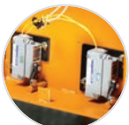
Swing door with interlocking on carriage