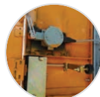
Mechanical Interlock for Collapsible Gate