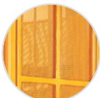
Perforated sheet on all the 4 sides