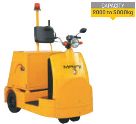
TT20S / TT50S