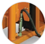
Hose burst check valve for added safety