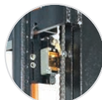
Limit switch cutoff on all the floors